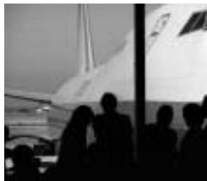
Integrates with Airport Facilities