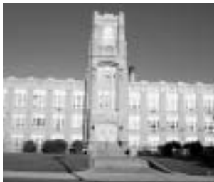
Integrates with Campus Environments