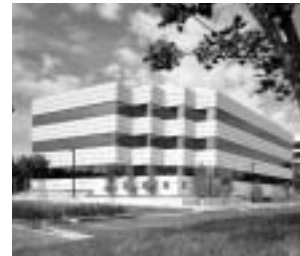
Integrates with Commercial Buildings