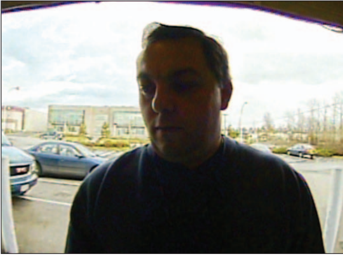
Conventional Camera in ATM Person is dark, outside exposed properly