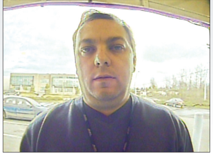
HCBWD Series in ATM Both person and outside exposed properly