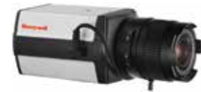
(Lens sold separately)