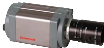
HCX3W Megapixel Camera