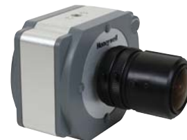
HCX13MW Megapixel Camera