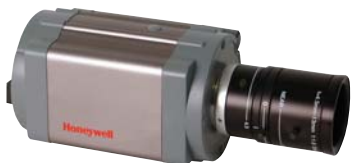
HCX5DW2 Megapixel Camera

Zoom in on any part of the image to reveal critical details.