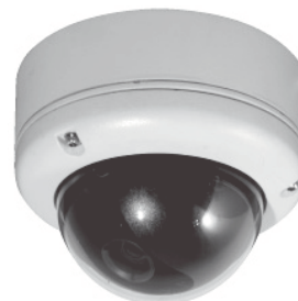
Shown with mounting ring for surface mount