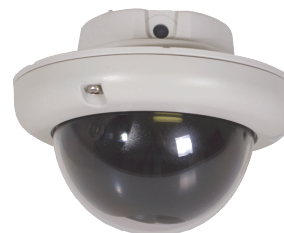
Shown without mounting ring for flush mount