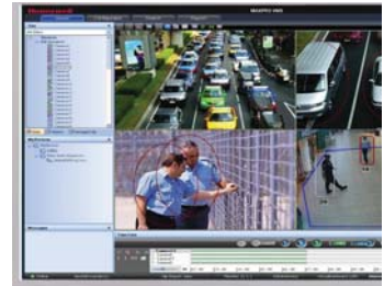
MAXPRO VMS Client Viewer 2x2