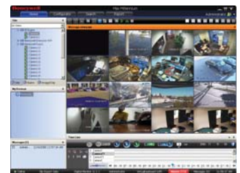
MAXPRO VMS Client Viewer 4x4