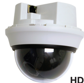
H3D2F shown with mounting ring for surface mount