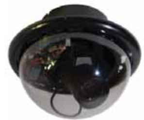
HD5 Series (Black shown)